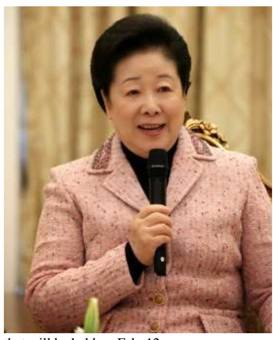
that will be held on Feb. 12.

2nd gen from 10 different nations gathered before the matching.