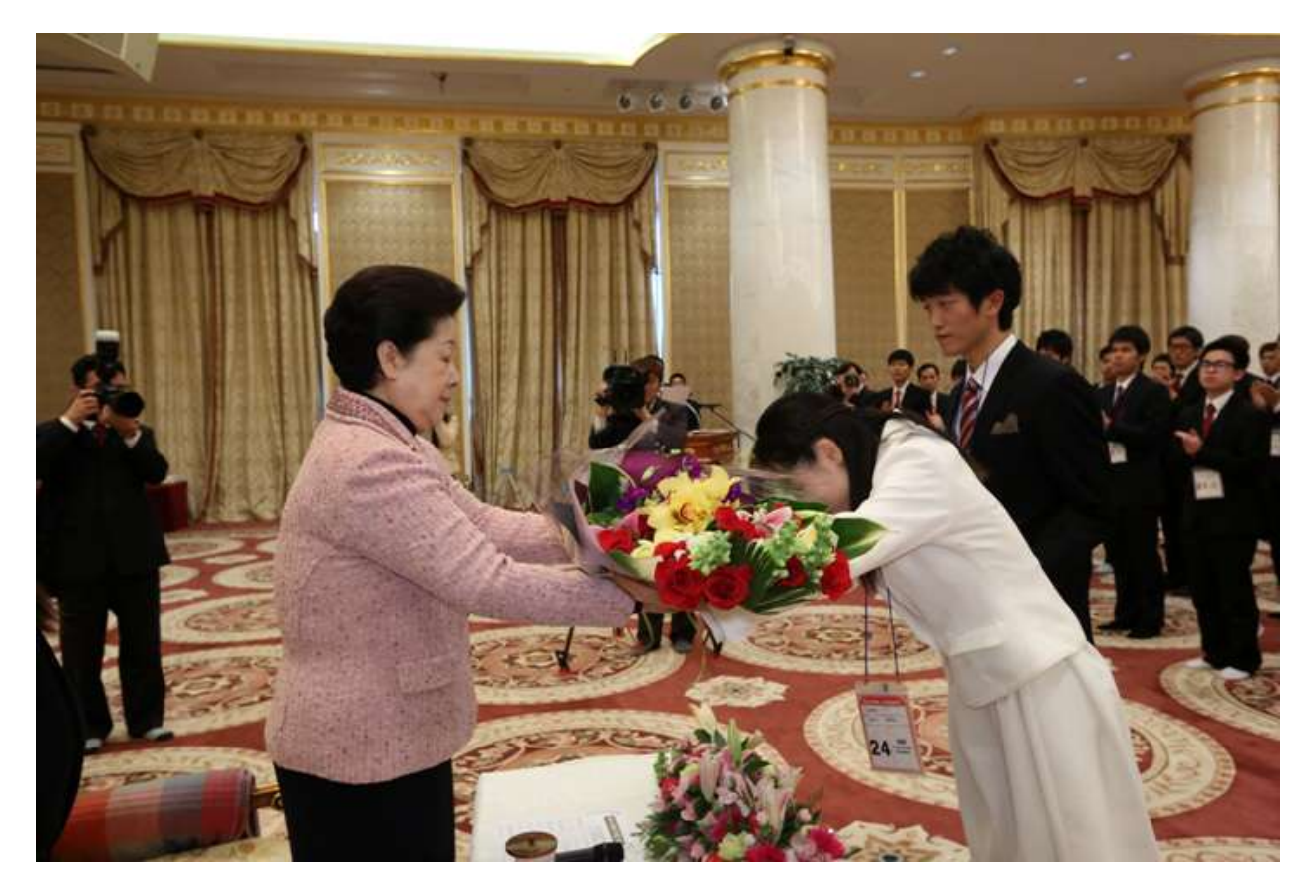
The 2nd generation are precious beings who have appeared for the first time in 6000 years.

The Cheon II Guk Matching commemorating the victory of the First Anniversary of Foundation Day, was held on January 9th, by the Heavenly Calendar (February 8, 2014) at 2:00 PM in the chapel on the 2nd floor of the Cheon Jeong Gung Palace. Blessing candidates from 10 countries participated in this matching presided by True Parents.