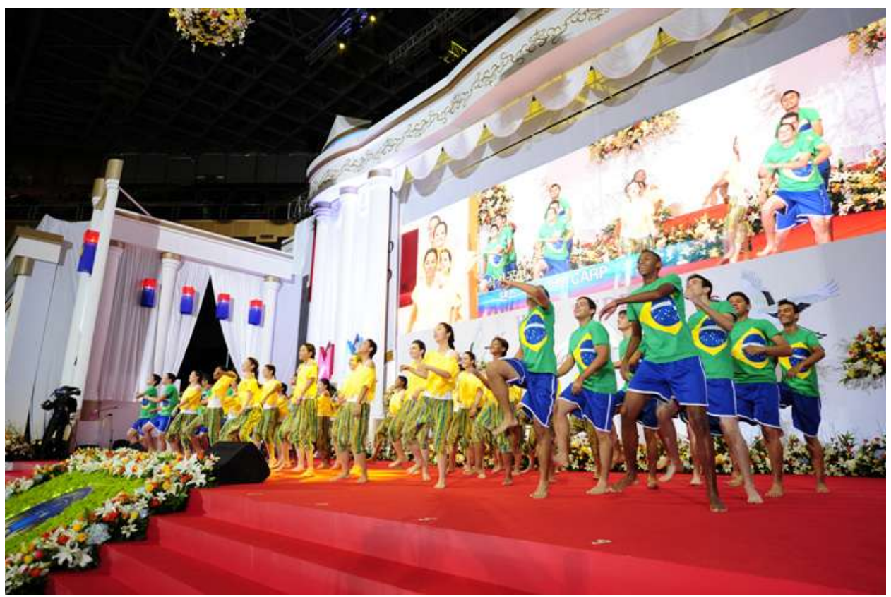
Pre-event dance performance by South American CARP

Day Commemoration Ceremony. The True Parents' Scriptures are the final installment in the Cheon II Guk Scriptures, and are the life and will for the foundation for Cheon II Guk. The Cheon II Guk Constitution was proclaimed with the deep meaning that it would become the system and standard for the substantial Cheon II Guk.