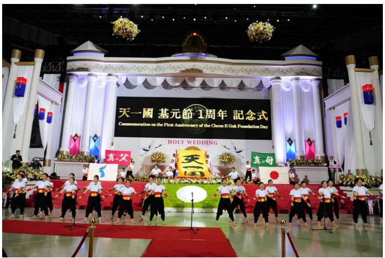
3rd pre-event dance performance by Japanese South Osaka Seonghwa Students

The Constitution of Cheon II Guk, which outlines the system and the standard of Cheon II Guk, was dedicated and proclaimed. After Cheon II Guk Foundation Day last year, True Mother gave direction for the Cheon II Guk Constitution to be quickly established. On the First Anniversary of True Father's Ascension last year, the basic draft was proclaimed, and afterwards, the basic laws were established. Today, in commemoration of the First Year Anniversary of the Cheon II Guk Foundation Day, the Constitution was officially dedicated and proclaimed.