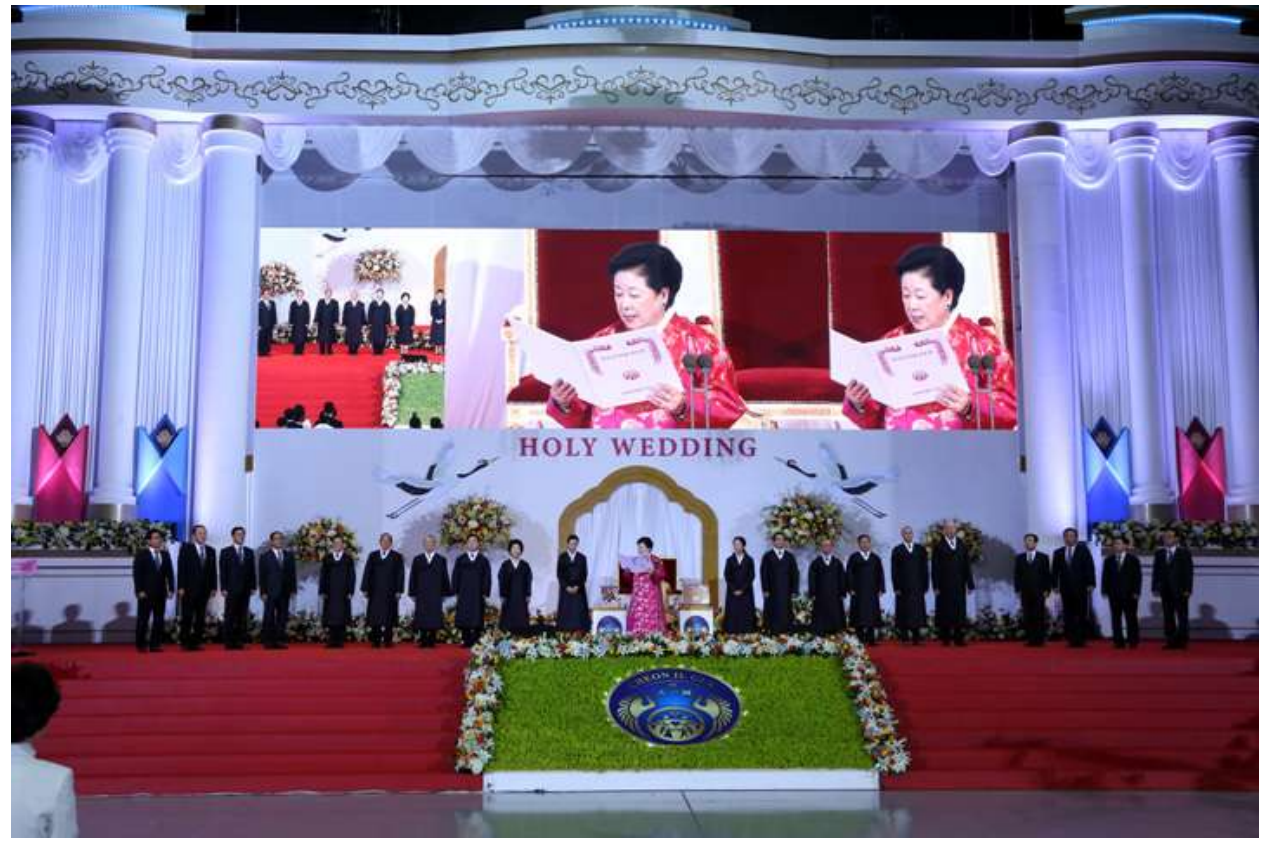
Proclamation of the Cheon Il Guk Constitution and the 12 Members of the Supreme Council