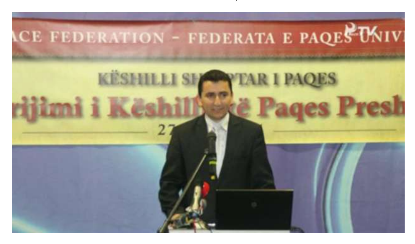
On April 27 Establishment of an Albanian Peace council in Presheva, Serbia (a town with a mainly ethnic population) under the title 'Peace Embassadors that Live for the Sake of Others'

Some 100 members of the society, including local government heads, scholars professors, representatives of specific groups and other leaders participated... The entire event was broadcast live on local TV.