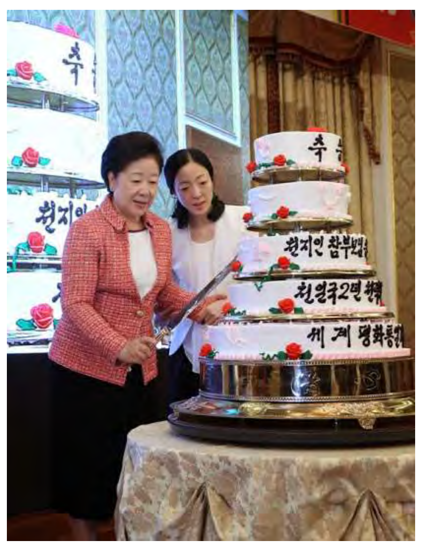
attend True Parents who are the root of heart, and receive education."

"Champumogyeong (참부모경) is absolute and perfect before humankind. You should study and understand it before you go to the spirit world. Among the three scriptures of Cheon II Guk, Champumogyeong (참부모경) is the most important one. This is the origin. How can I conclude this scripture? By investing more time, I will make this a perfect jewel. Do you understand?"