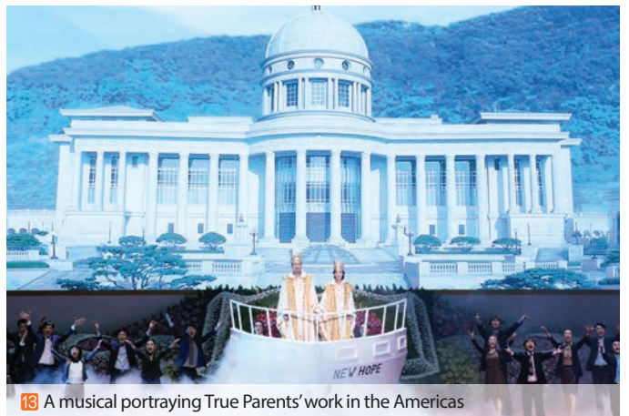
13 A musical portraying True Parents' work in the Americas