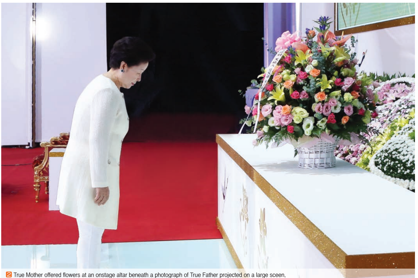
2 True Mother offered flowers at an onstage altar beneath a photograph of True Father projected on a large screen.