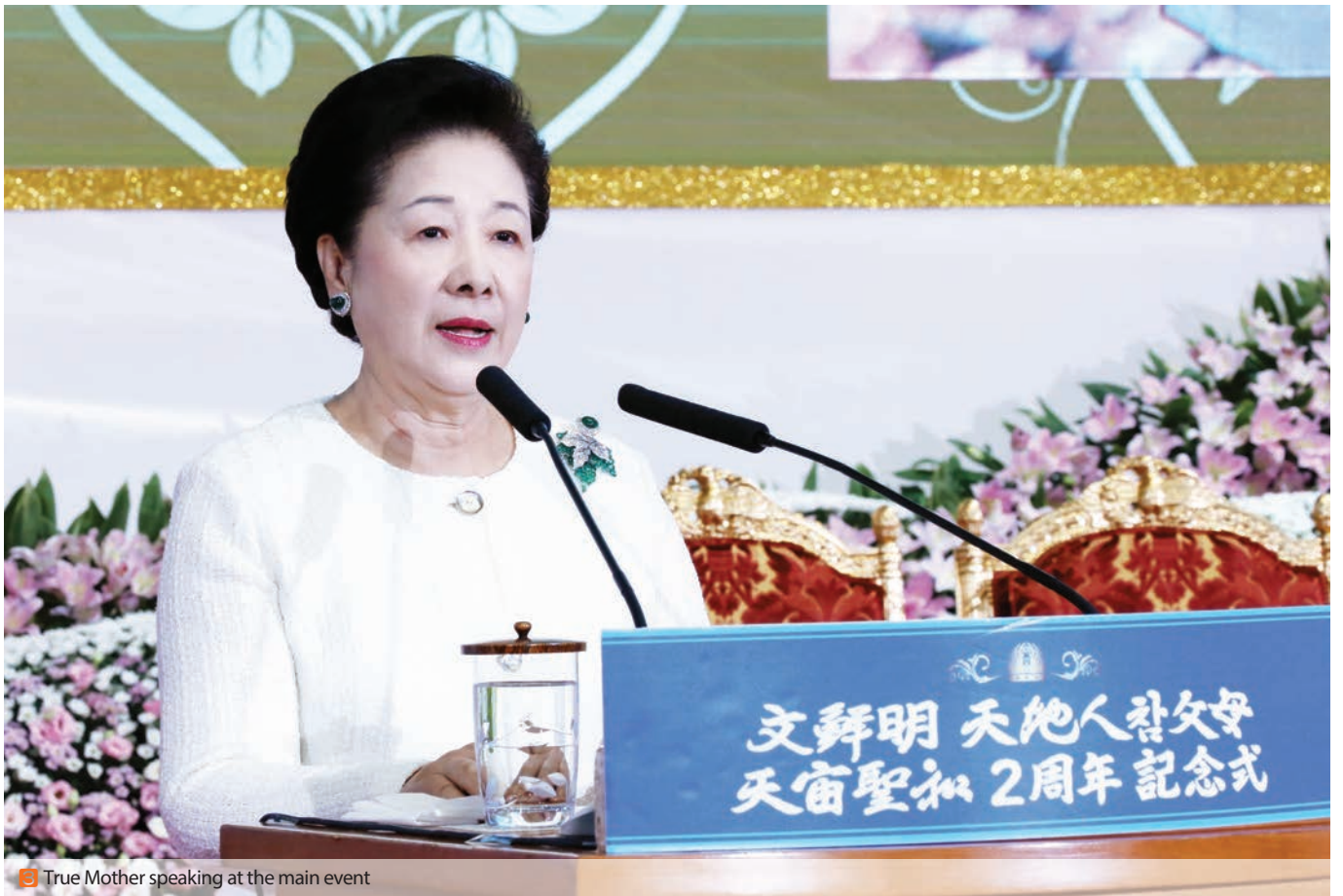
3 True Mother speaking at the main event