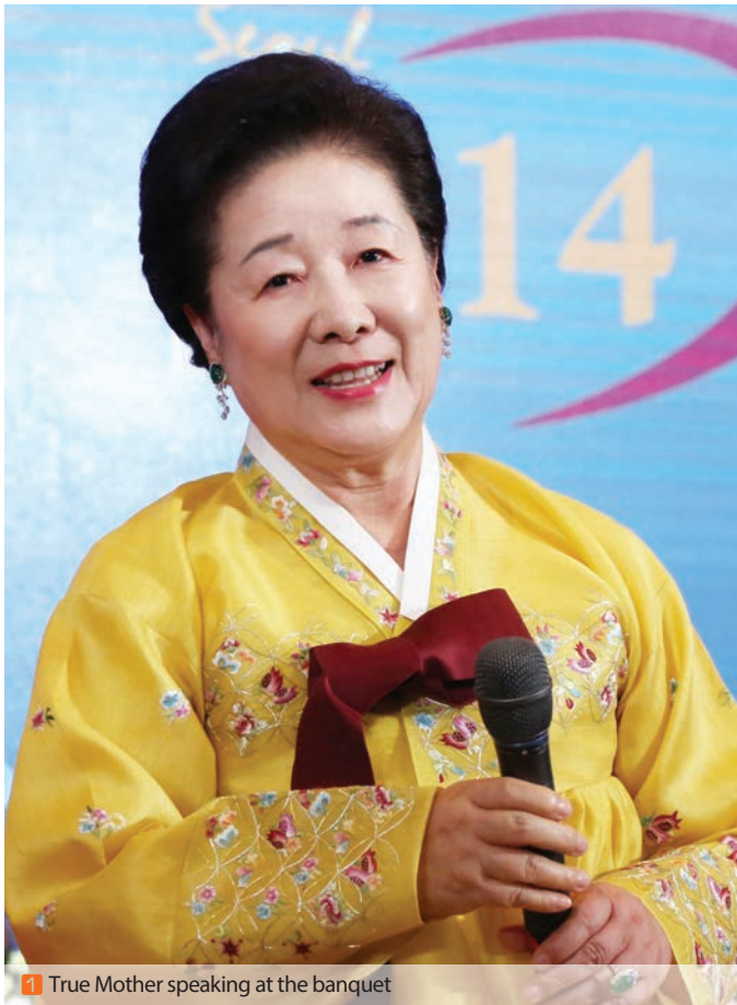
1 True Mother speaking at the banquet