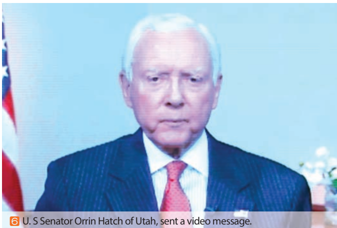
6 U. S Senator Orrin Hatch of Utah, sent a video message.