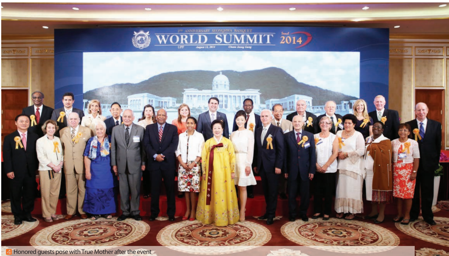
4 Honored guests pose with True Mother after the event