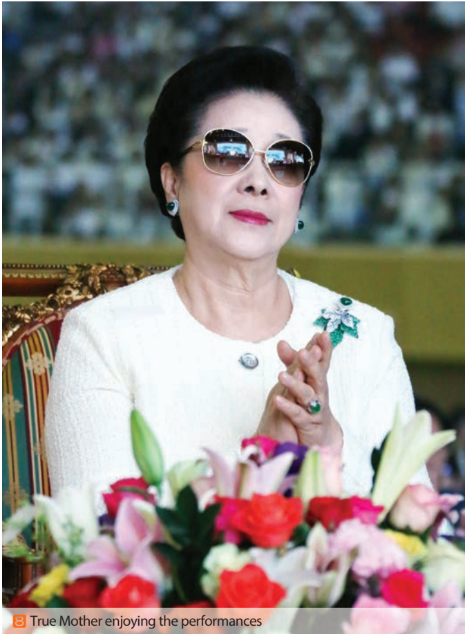
8 True Mother enjoying the performances