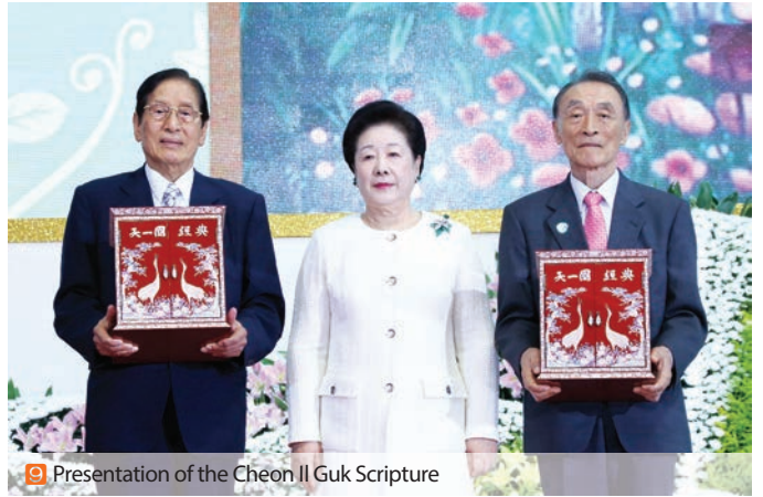
9 Presentation of the Cheon Il Guk Scripture