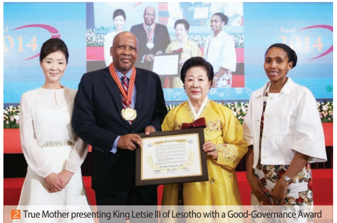
2 True Mother presenting King Letsie III of Lesotho with a Good-Governance Award