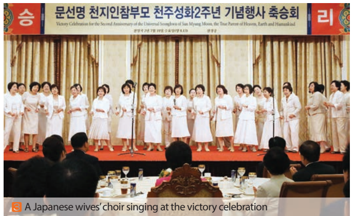
3 A Japanese wives' choir singing at the victory celebration