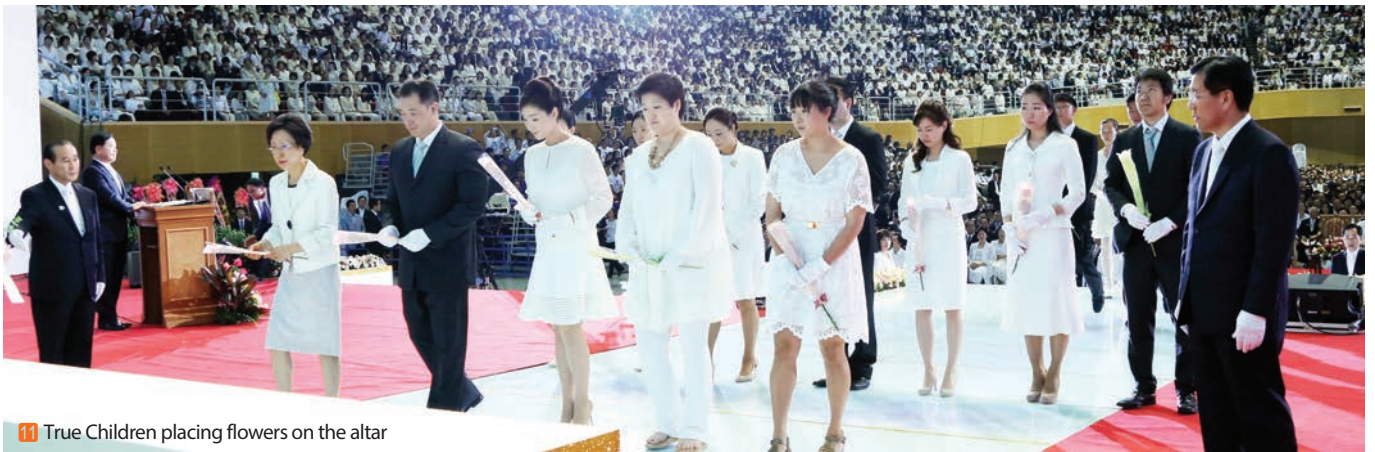
11 True Children placing flowers on the altar