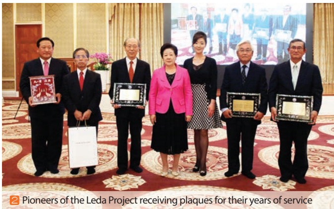
2 Pioneers of the Leda Project receiving plaques for their years of service