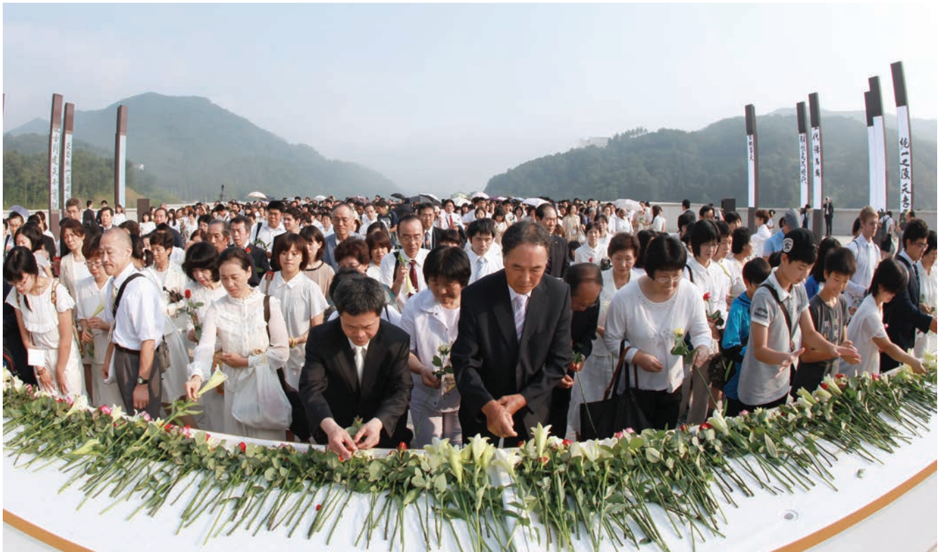
1 Members offering flowers at the second anniversary of True Father's seonghwa in front of the entrance to the Cheongshim Peace World Center