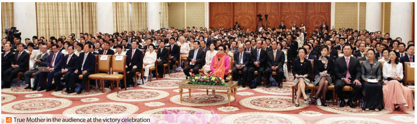
4 True Mother in the audience at the victory celebration