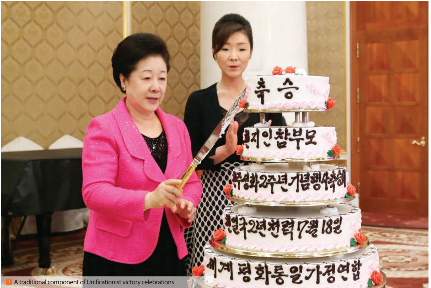
1 A traditional component of Unificationist victory celebrations