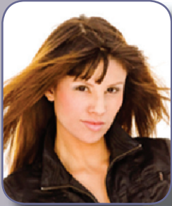
Nya Lyte Entertainment Industry