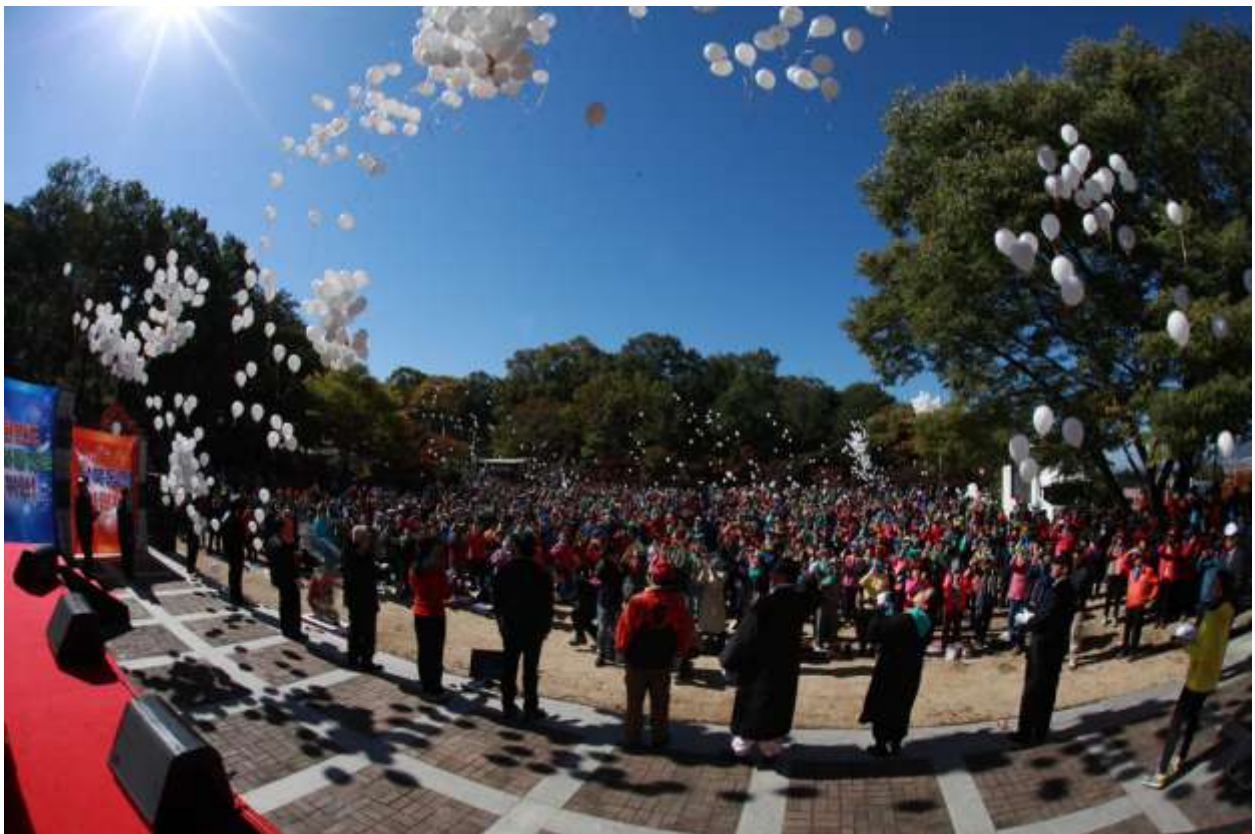
Performance wishing Unification between South and North (Flying a balloon for wishing Unification between South and North)