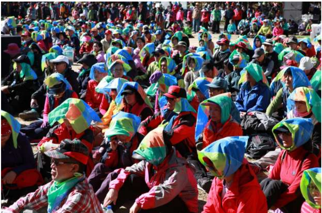
Participants listening to the speech