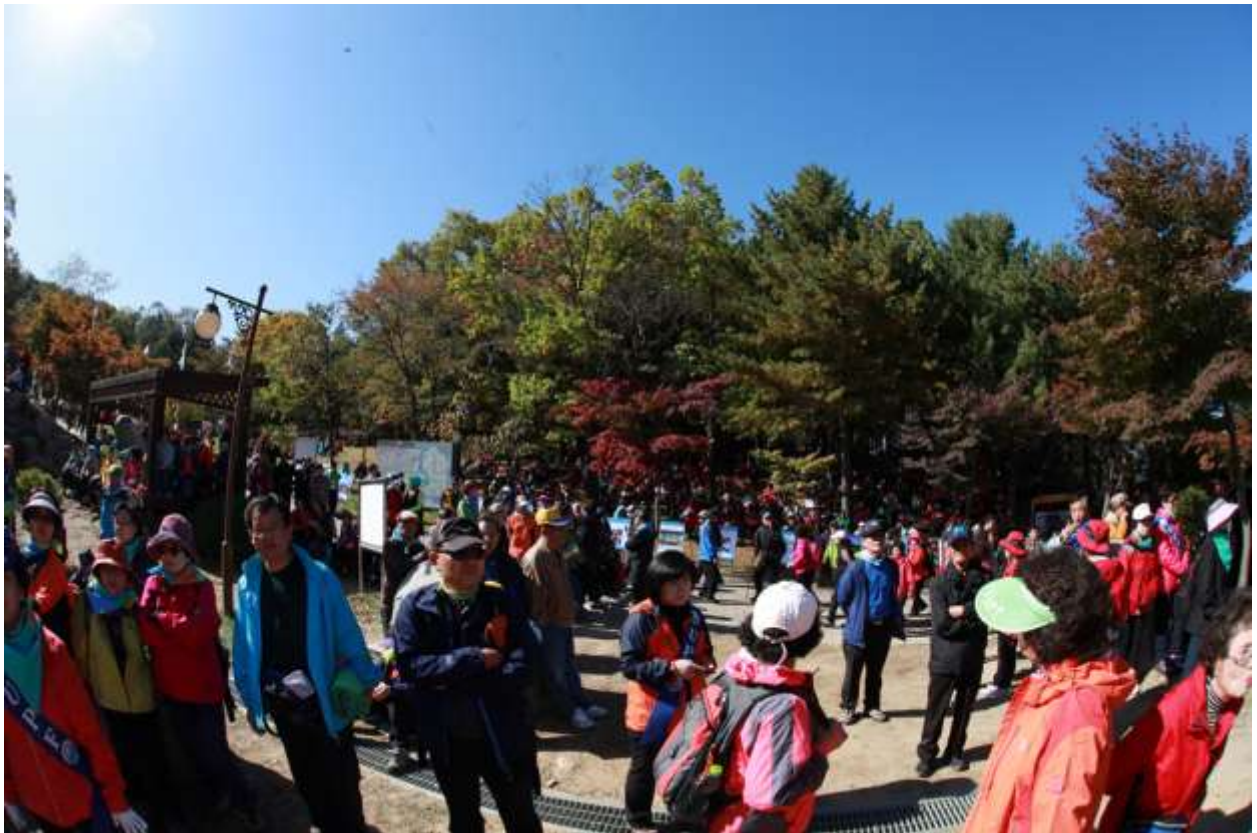
Participants for the rally for 'Strong Korea'