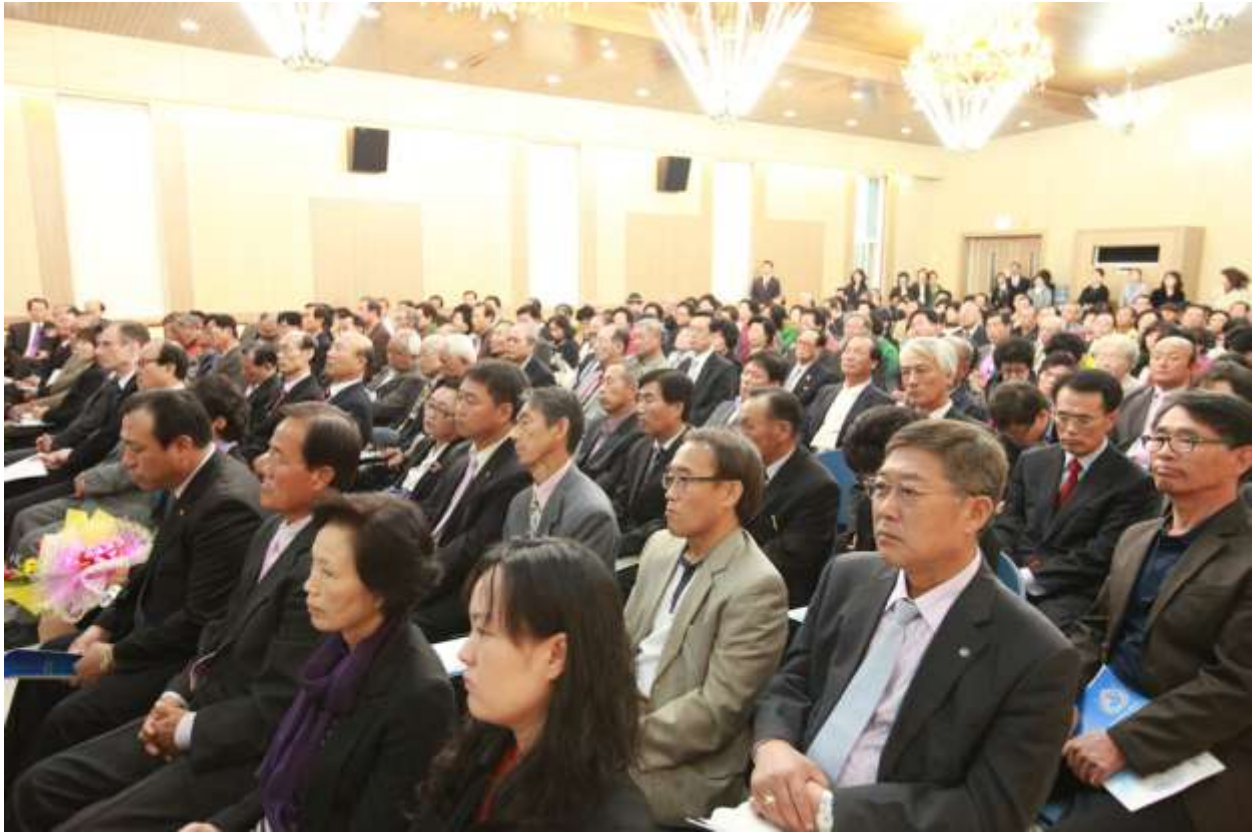
Audience listening to the lecture