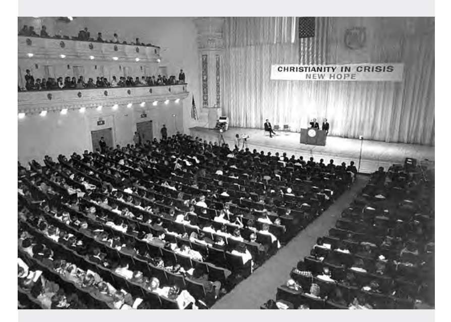
New York's Carnegie Hall on October 1, 1973, the first stop on a 21-city speaking tour of the United States that ended January 29, 1974.