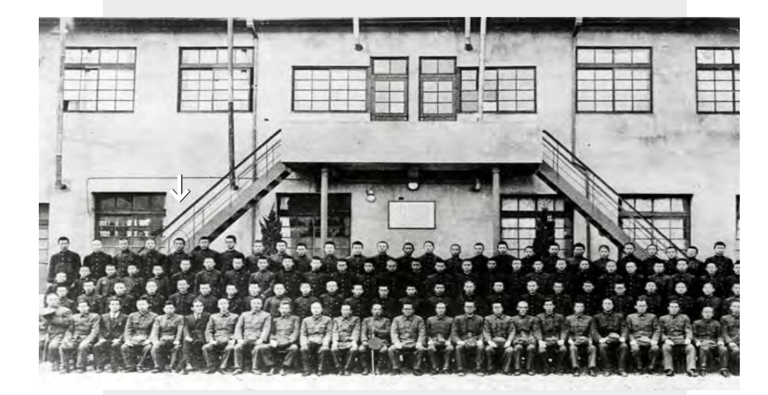
March 8, 1941. Commencement ceremony of the third graduating class of Kyeongsung School of Commerce and Technology. I am in the back row, fifth from the left ( see arrow ).