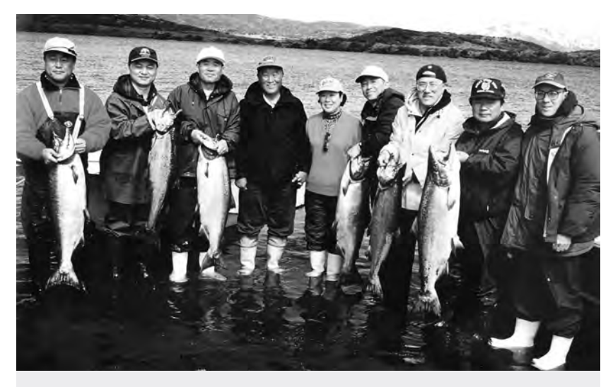
August 1998, fishing for king salmon in Kodiak, Alaska. I am fourth from the left, next to my wife. Church leaders are on either side.