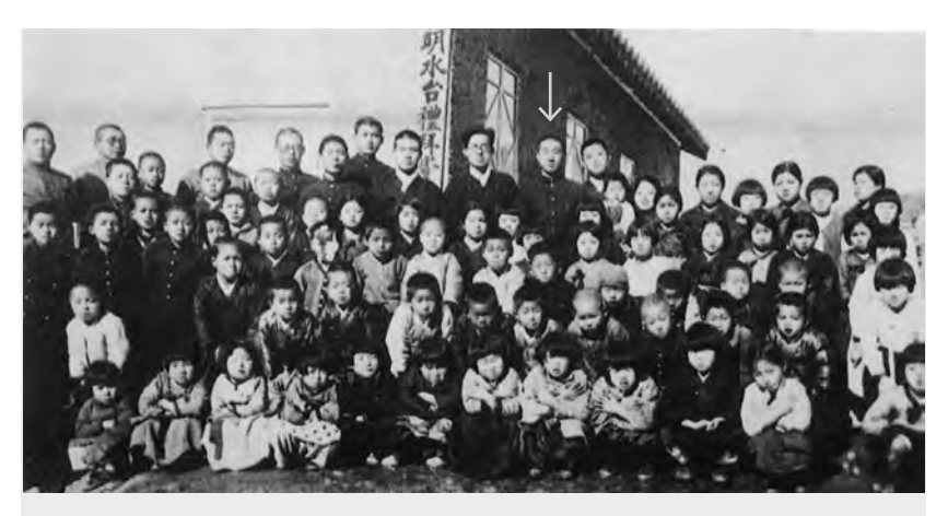
I taught Sunday School at the Myungsudae Jesus Church in Seoul in the early 1940s. I am standing in the back row (see arrow ).