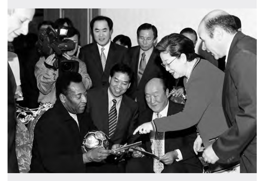
On June 4, 2002, soccer great Pelé paid a courtesy visit to my residence in Hannam-Dong. Here my wife explains the World Peace Cup Soccer Tournament. I shared with Pelé the vision of promoting soccer as a way to build bridges of peace between nations.