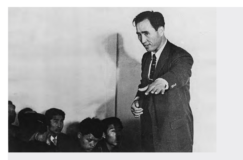
Teaching members in our church in Cheongpa-Dong right after coming out of Seodaemun Prison.