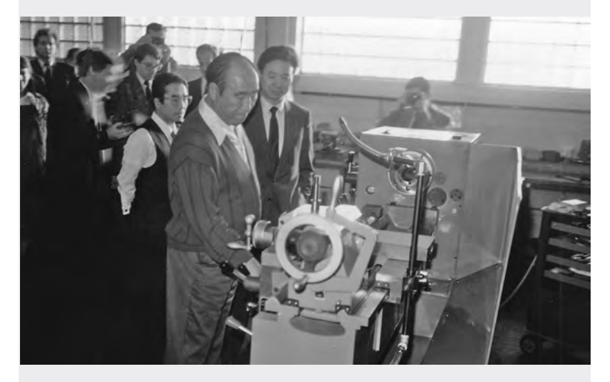
Visiting our machine shop in Germany in 1989. I have long advocated that advanced technology should be shared among all nations to promote freedom and prosperity.

I purchased this former Christian Brothers Catholic Seminary on the Hudson River in Upstate New York in 1975 to found the Unification Theological Seminary (UTS), open to all faiths. I chose a faculty consisting of scholars from each world religion.