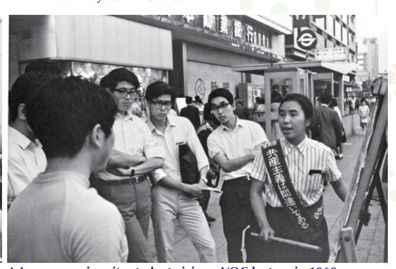
A Japanese university student giving a VOC lecture in 1969