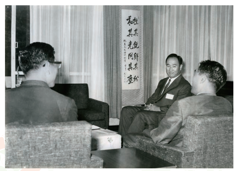
True Father attended a conference, Research Meeting on New Religions, at Academy House in Seoul in September 1968, at which he spoke and spent time with other religious leaders.

wrestling, victory or defeat is decided only after the match is actually held, isn't it? Retreating without even having a match is a defeat. You are making this proposal because you are not strong enough." In that way, I suppressed all his pessimistic feelings. He seemed very weighed down, perhaps because there were many problems. He must have been very worried.