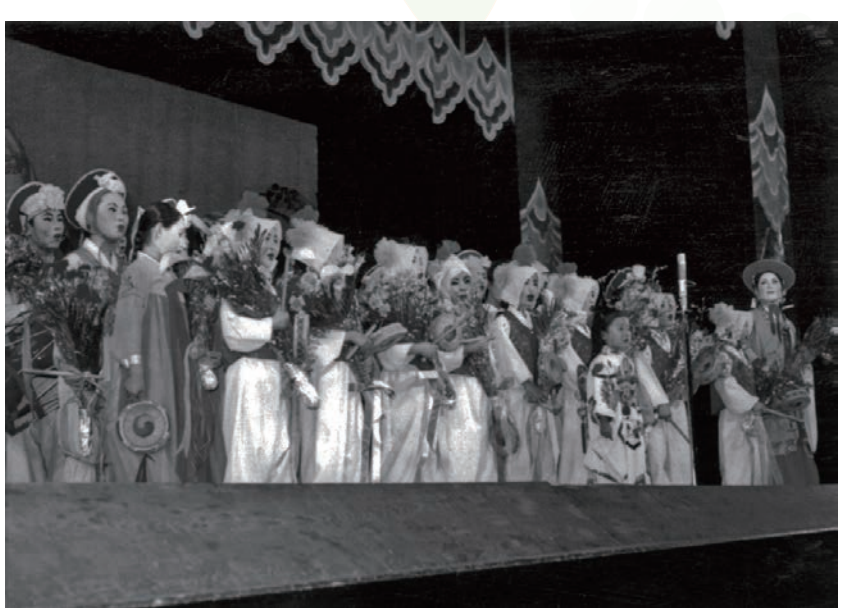
The Sunhwa Children's Dance Troupe (later known as the Little Angels) during their tour of Japan in 1969

To them, I might have looked insignificant, as if a whiff of wind could blow me away, but as the times change they come to realize that I am not who they thought I was. Now, in fact, I was in a position where I could feel sympathy for them. The fact that they received me and are now even recommending the truth of the Unification Church to others shows that they have as good as bowed their heads before us.