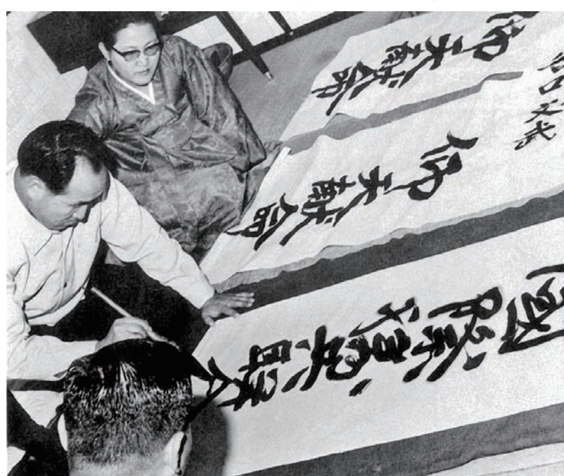
Left: True Father with church officials at a factory operated by our church members, January 11, 1969; Right: Father writes in calligraphy to mark the founding of International Federation for Victory Over Communism in January 1968.