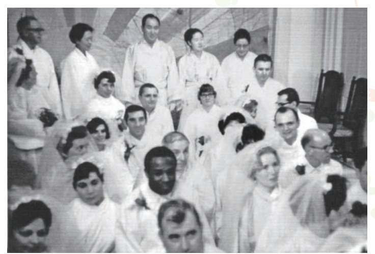
The thirteen couples blessed on February 28, 1969, in Washington DC in the 3-stage, 43-Couple Blessing Ceremony—which included 22 couples blessed in Japan and 8 in Germany.