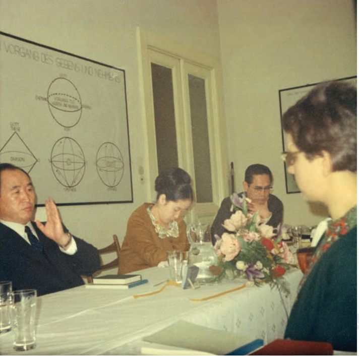
True Parents in Vienna, Austria, during the same world tour

I visited a diplomat in charge of public information at the Korean Embassy in Japan and told him, "I know that you