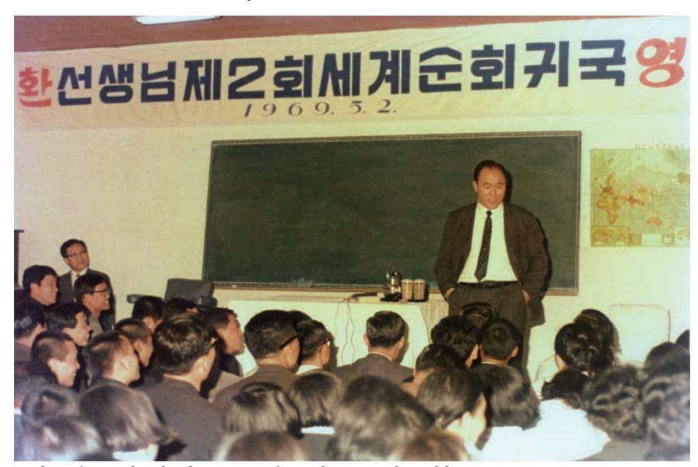
Welcoming Father back to Korea from the second world tour, May 2, 1969

The United States cannot even think about retreating in the fight against communism. I have emphasized the need to work in every way possible to defend the battle line in America. It is up to CARP and the Federation for Victory over Communism to carry out this work.