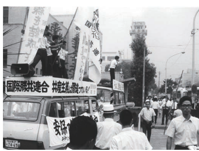
Victory Over Communism activities in Shizuoka, Japan in August 1969

8 1931–1998, president of the church in Japan 1964–1991