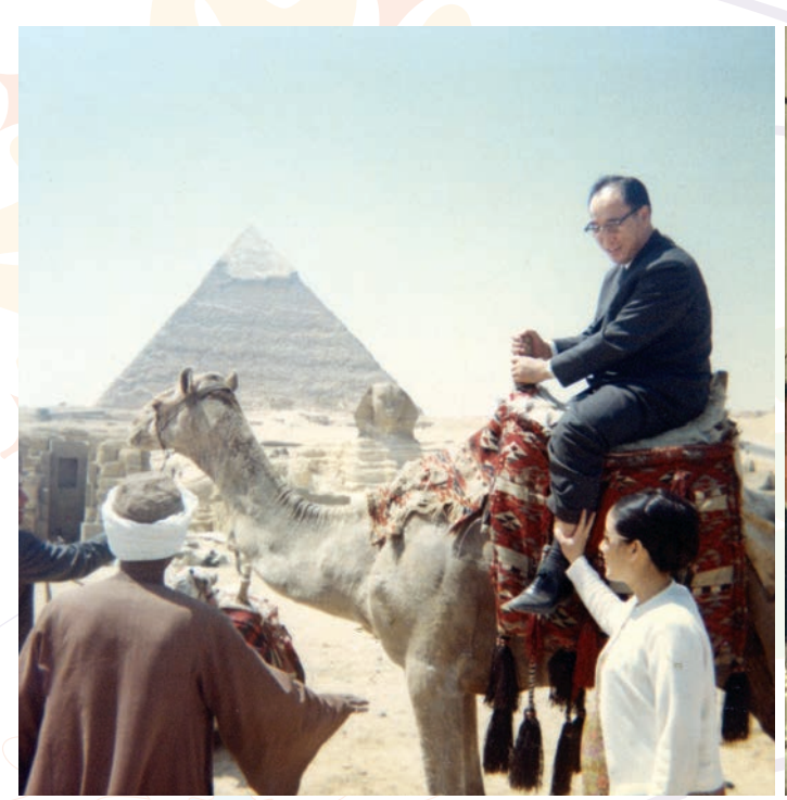
True Father riding a camel in Egypt, True Mother by his side, during the second world tour in 1969