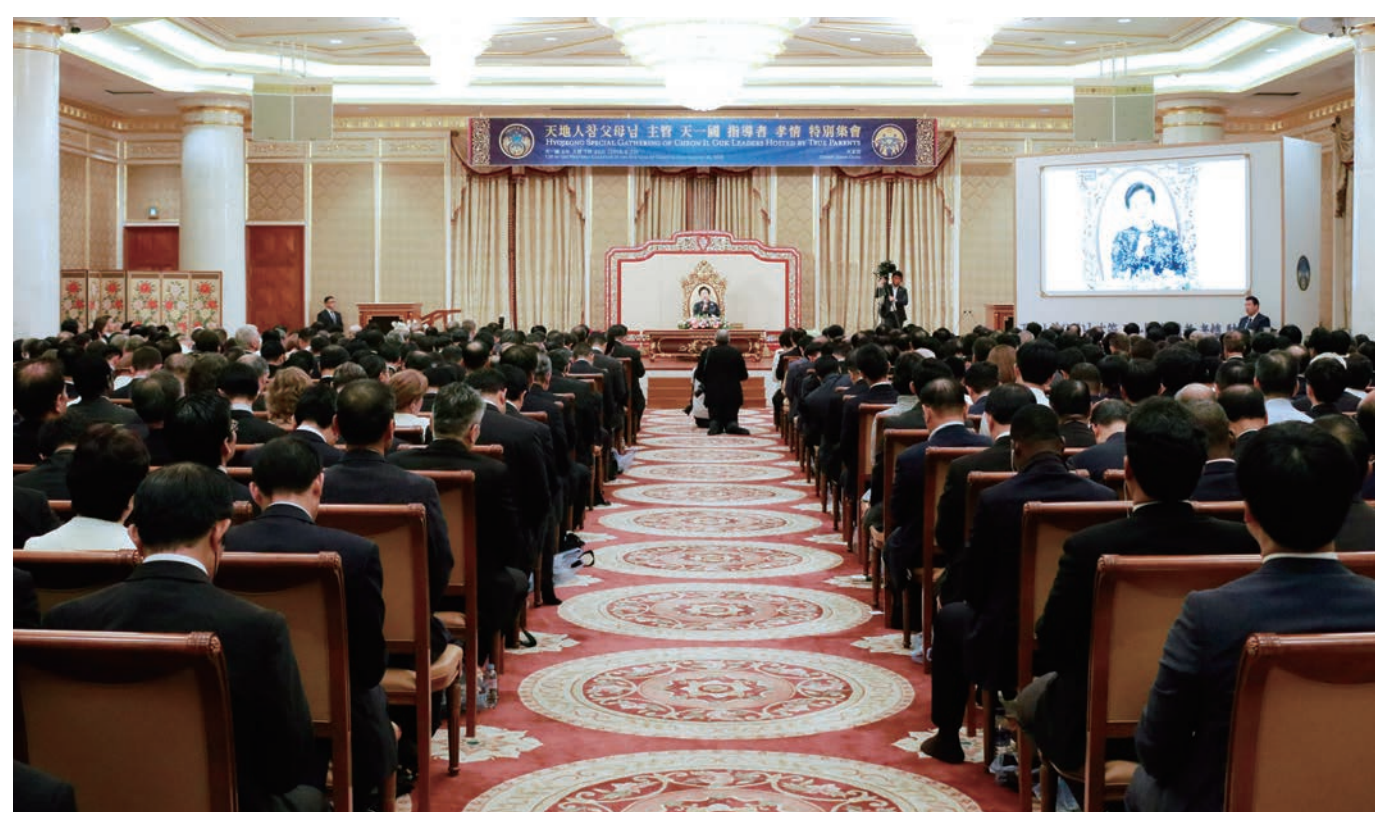
True Mother speaking to the audience of leaders who had come on the occasion of the sixth anniversary of True Father's Holy Ascension to reconnect with True Parents and return to their mission fields with the fire True Parents' spirit rekindled in their hearts.

anniversary of the Holy Wedding. Almost sixty years have passed. Particularly during the Seonghwa Festival, when True Parents are planning to host the Blessing Ceremony, all of humanity needs to know they must be reborn with new life once again through the blessing bestowed by True Parents. These seven billion people living at the same time as True Parents do not know who True Parents are. They were not even able to hear the term "the blessing." Why does fallen humanity not know that they are living in the time when they can return as Heavenly Parent's children? Why could they not participate in the blessing?